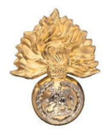
The Capbadge and Hackle of the Royal Regiment of Fusiliers

Born in England in 1845, he served three years as a Captain in the Royal Regiment of Fusiliers, a famous infantry regiment of the British Army.